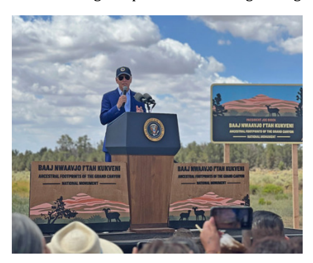
President Biden established the Baaj Nwaavjo I'tah Kukveni – Ancestral Footprints of the Grand Canyon National Monument.

Baaj Nwaavjo I'tah Kukveni – Ancestral Footprints of the Grand Canyon National Monument: President Biden established the Baaj Nwaavjo I'tah Kukveni – Ancestral Footprints of the Grand Canyon National Monument in Arizona. The new monument conserves nearly one